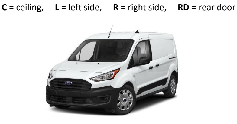
Driver Side / Left Side

Alphanumeric reference is printed on release paper side of each piece. The numbering system designates left, right, ceiling and position on the vehicle: